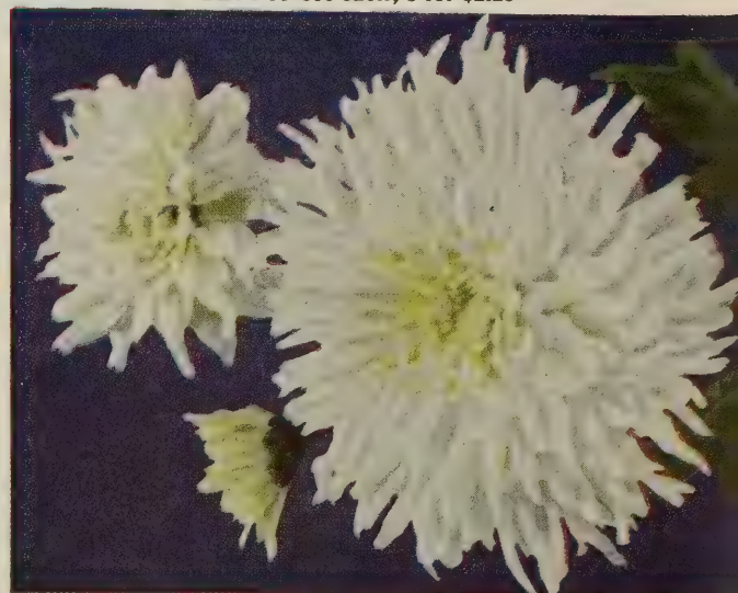
SPINDRIFT. $1.00 each; 3 for $2.50